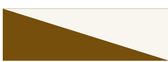
Brave Khakhi with Arctic White Roof