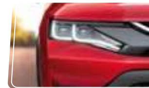
Dual LED Projector Headlamps with LED DRLs