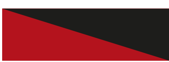
Sizzling Red with Midnight Black Roof