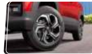
Bold Geometric Alloy Wheels

The Hot and Techy Brezza introduces a youthful and energetic design, ensuring you are ready for an adventurous drive in the city every day. Its commanding stance, impressive looks and precision detailing ensure that it never goes unnoticed. The City-Bred SUV comes with a clean Beltline with Bold Geometric Alloy Wheels, Dual Tone exteriors with a Shark Fin Antenna that enhances its design.