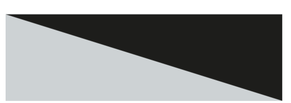
Splendid Silver with Midnight Black Roof