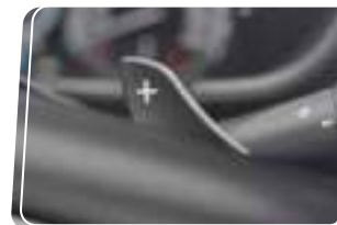
6-Speed AT with Paddle Shifters