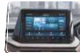
SmartPlay Pro+ with Surround Sense powered by ARKAMYS