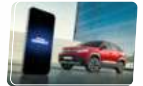
Next Gen Suzuki Connect