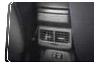
Rear AC Vents with Fast Charging USB Ports