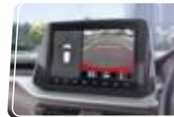
360 View Camera